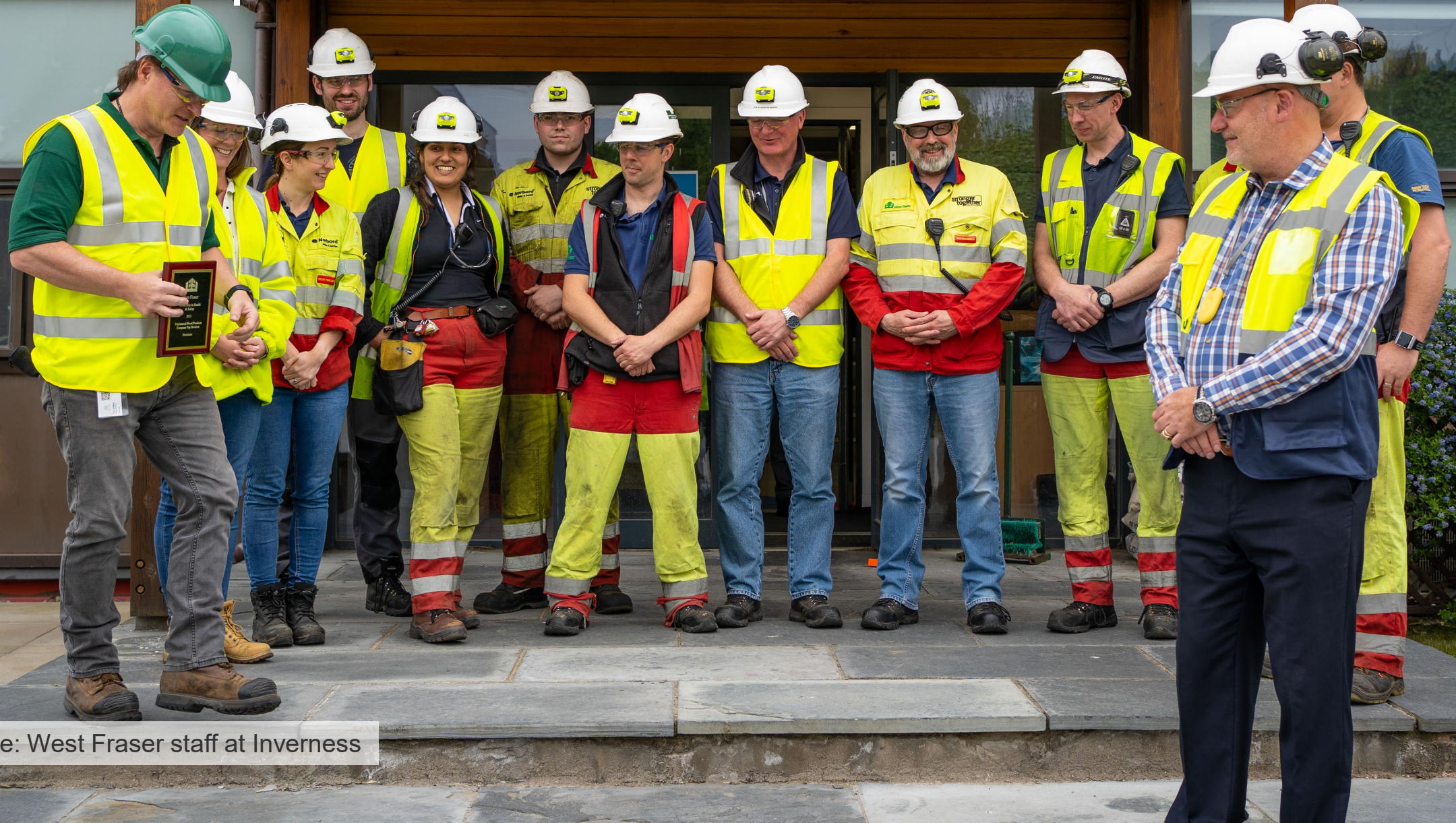
Image: West Fraser staff at Inverness

Proudly supporting forestry jobs and management processes with well paid careers