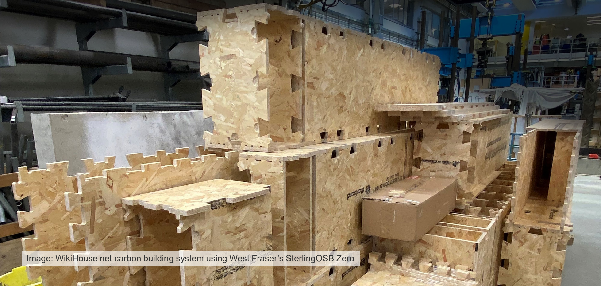
Image: WikiHouse net carbon building system using West Fraser's SterlingOSB Zero