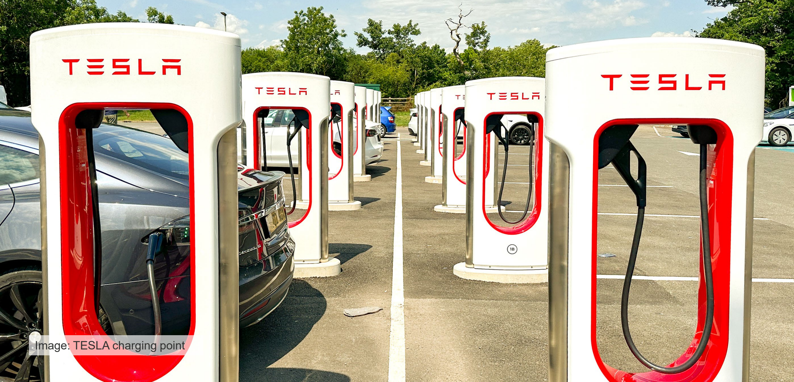
Image: TESLA charging point