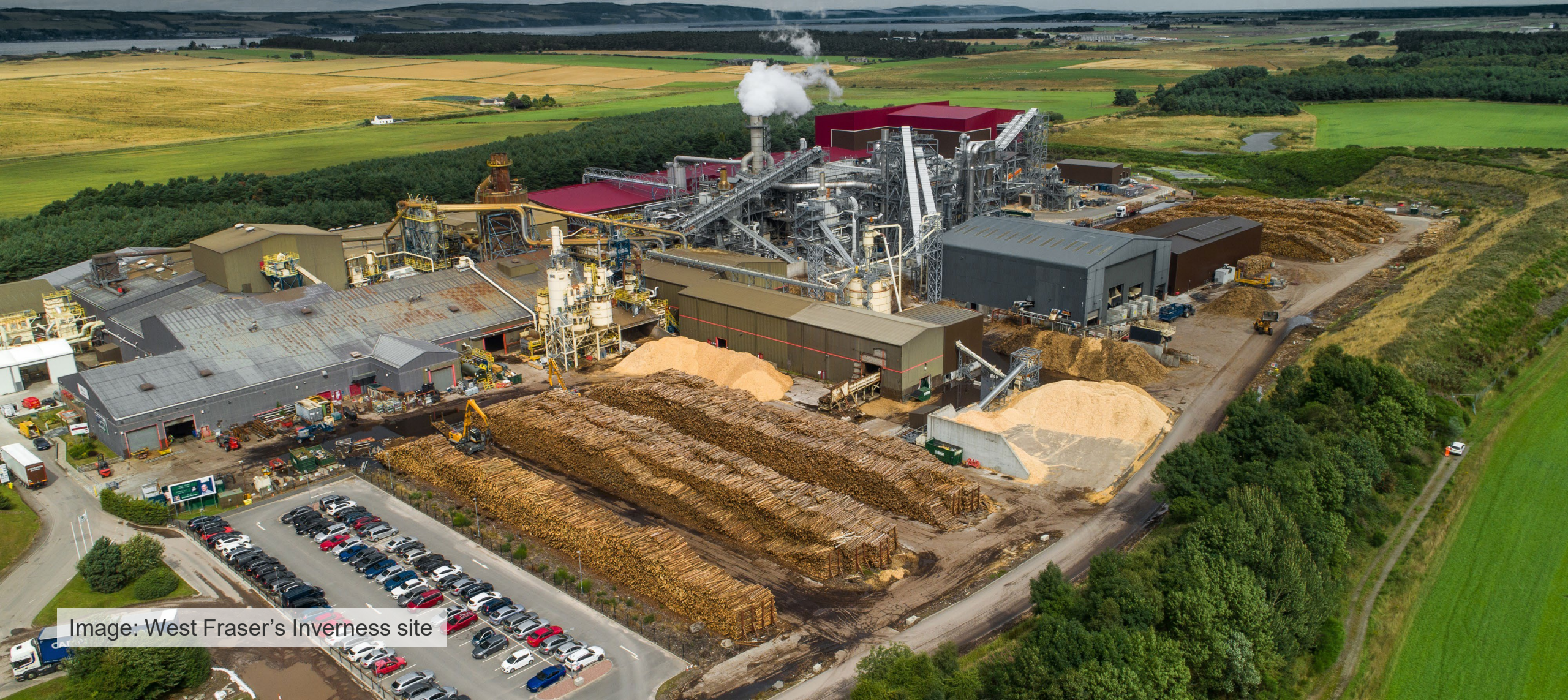
Image: West Fraser's Inverness site